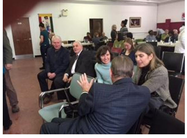
BOARD MEMBERS AT WARREN ALLMAND'S MB OPENING