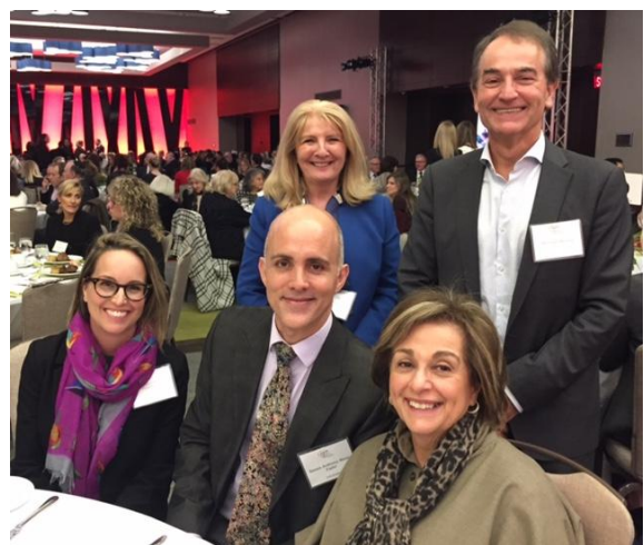
AFP NATIONAL PHILANTHROPY DAY 2017