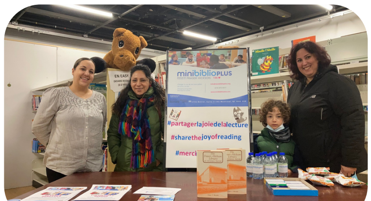
Partner Association des parents CDN at the Fraser-Hickson Library as part of the Share the Joy of Reading event