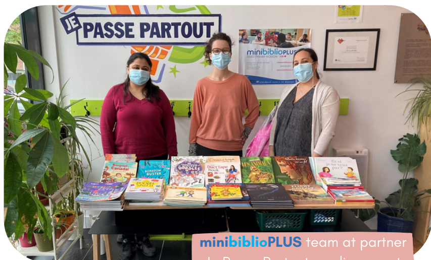
minibibliPLUS team at partner Je Passe Partout reading event