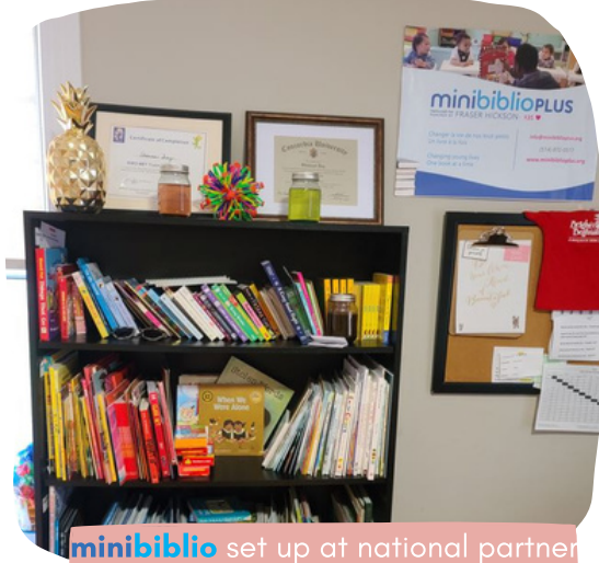
minibiblio set up at national partner - Bright Beginnings, Gaspé