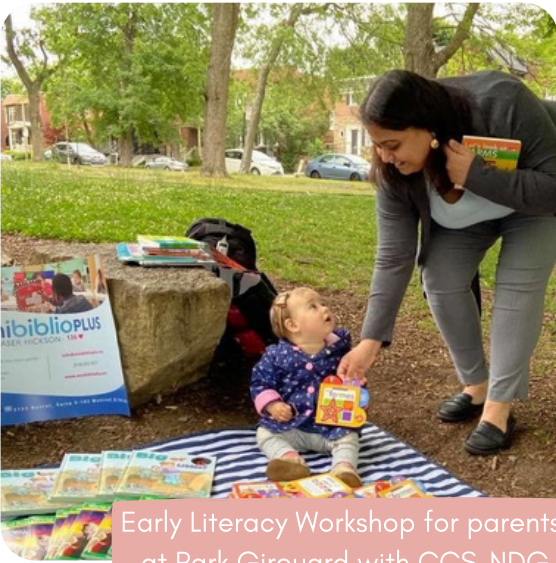
Early Literacy Workshop for parents at Park Girouard with CCS-NDG