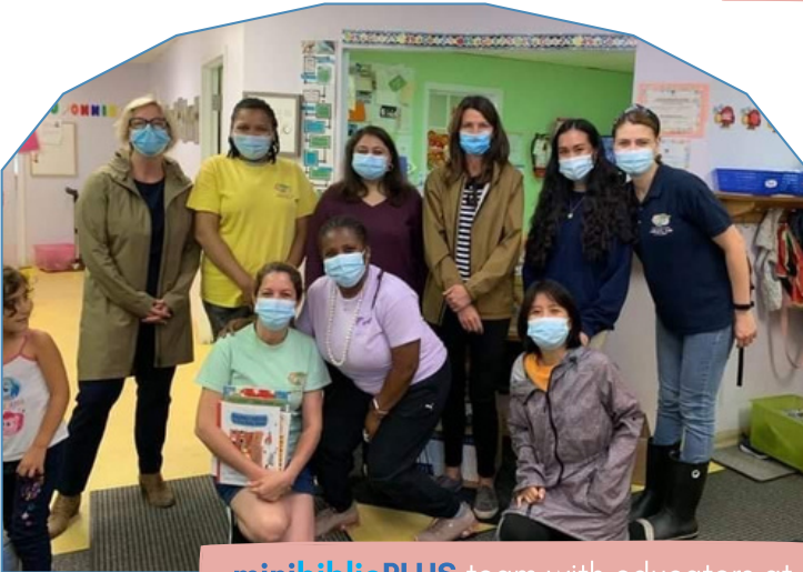
minibiblioPLUS team with educators at partner Garderie Juliette Léa et cie