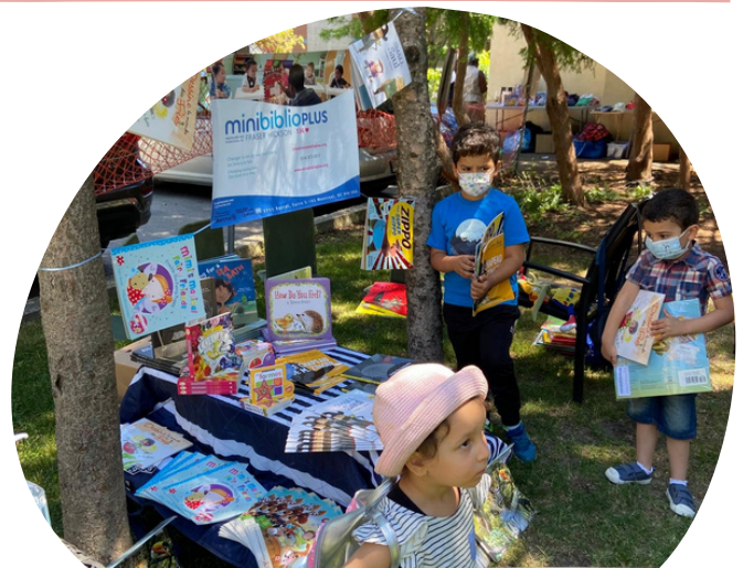
minibiblioPLUS shares the joy of books with the children of La MaisonBleue CDN