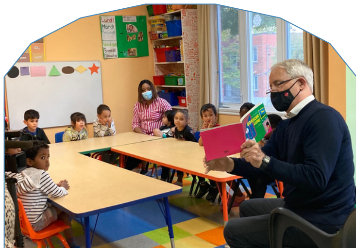
International Literacy Day Event - Honorable MP Marc Garneau reading to children at Garderie Mary Poppins