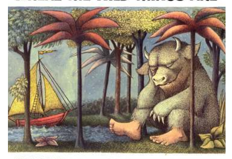
STORY AND PICTURES BY MAURICE SENDAK